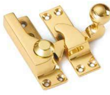
Large Straight Arm Sash Fastener

2825N 67mm (shown) 2825NL Locking Version suitable for narrow sashes, 15mm wide body