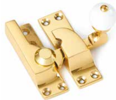
Large Straight Arm Sash Fastener