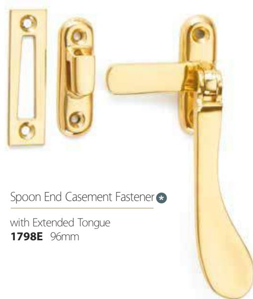
Spoon End Casement Fastener * with Extended Tongue 1798E 96mm