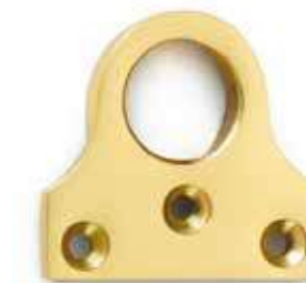
Flat Sash Eye