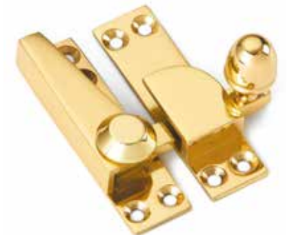
Acorn Knob Sash Fastener

1035 67mm 1035L 67mm Locking version ( shown )