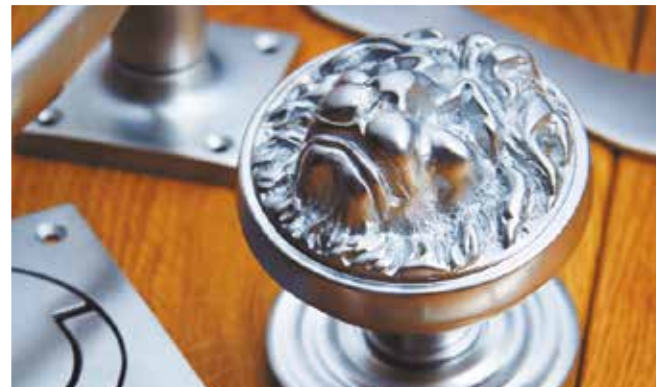
Satin Chrome Plate SCP