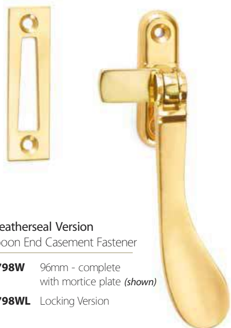
Weatherseal Version Spoon End Casement Fastener 1798W 96mm - complete with mortice plate (shown) 1798WL Locking Version