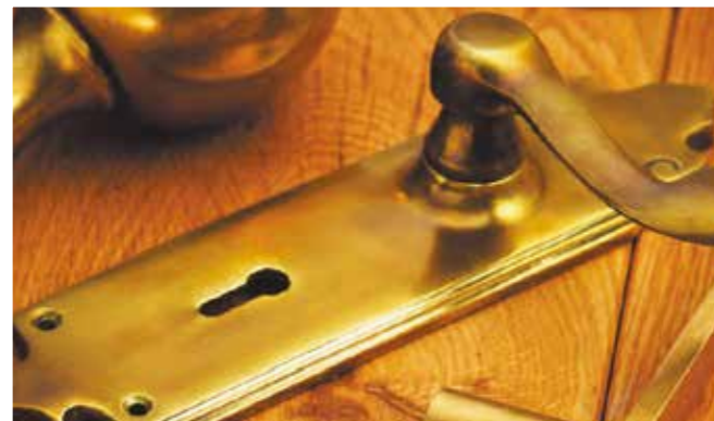
Aged Brass * AGD