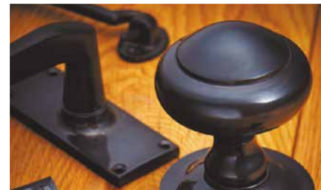
Dark Bronze Metal Antique * DBMA