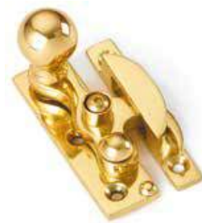
Bulb End Claw Fastener

3465 63mm 3465L Locking Version (shown) suitable for narrow sashes, 15mm