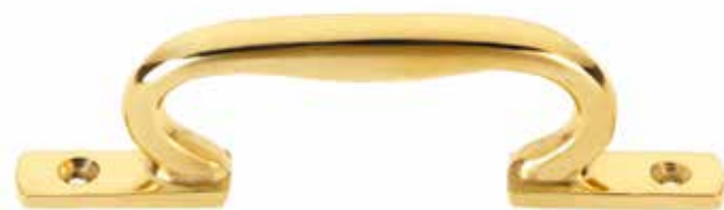
6429 Sash Handle 125mm