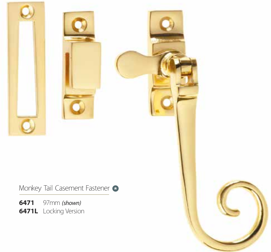
Monkey Tail Casement Fastener * 6471 97mm (shown) 6471L Locking Version