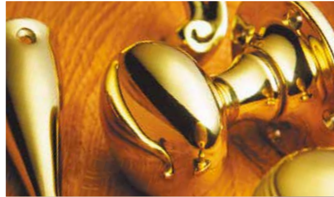
Polished Brass Unlacquered PBUL