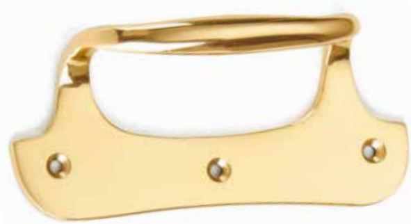
6426 Ornate Sash Handle 126mm