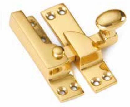
Straight Arm Sash Fastener - Narrow

1762A 67mm suitable for narrow sashes, 17mm wide body