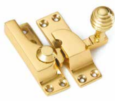
Large Straight Arm Sash Fastener