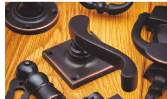
Oil Rubbed Bronze * ORB