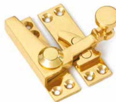
Quadrant Arm Sash Fastener

1036 67mm ( shown ) 1036L Locking version