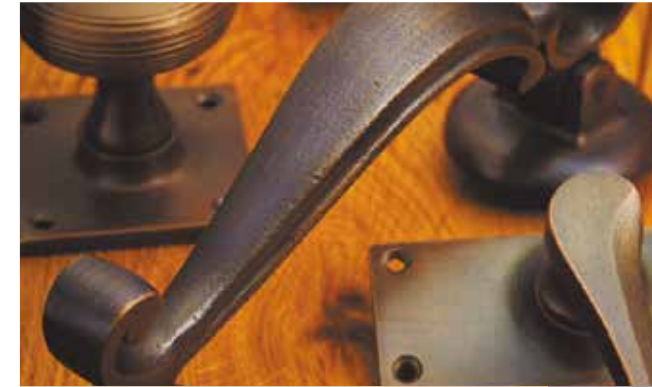
Tudor Bronze TB