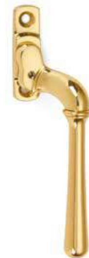
Bulb End - Narrow Style 1796 60 x 16mm Backplate 1796L Locking Version ( shown )

6462 60x 25mm Backplate ( shown ) 6462L Locking Version