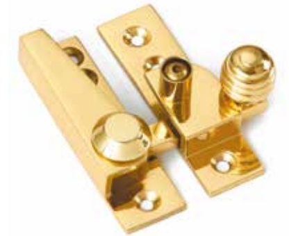
Reeded Knob Sash Fastener

1035 67mm 1035L 67mm Locking version ( shown )