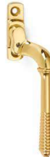
Reeded - Narrow Style 6440 60 x 16mm Backplate 6440L Locking Version ( shown )