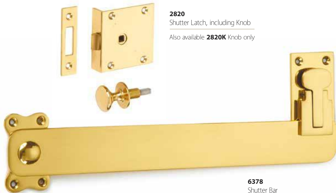
2820 Shutter Latch, including Knob Also available 2820K Knob only