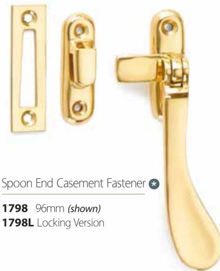
Spoon End Casement Fastener * 1798 96mm (shown) 1798L Locking Version