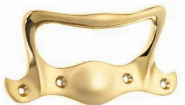
6428 Art Nouveau Sash Handle 122mm