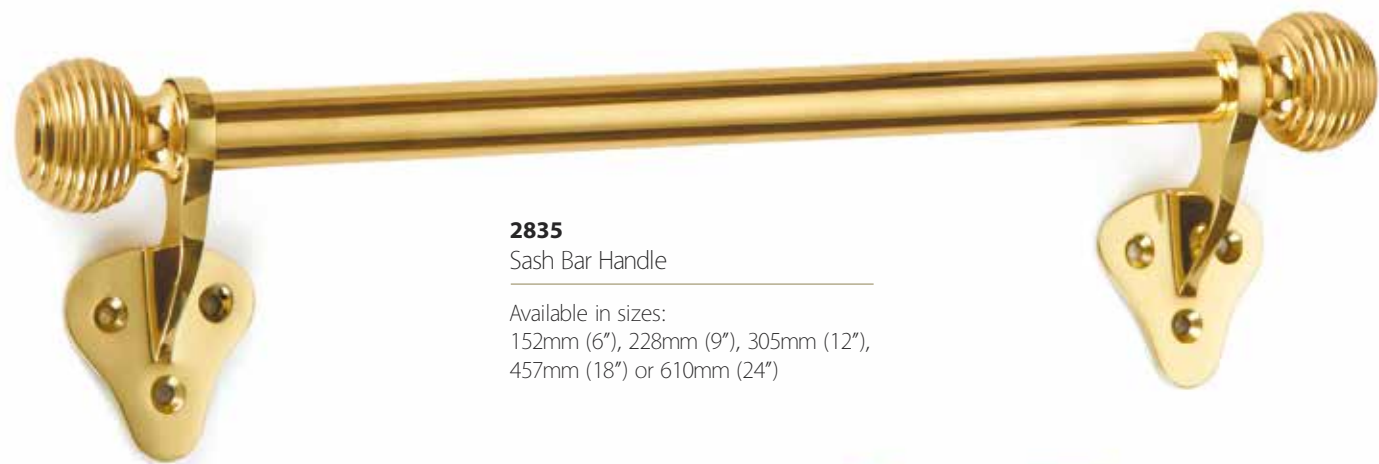
2835 Sash Bar Handle Available in sizes: 152mm (6"), 228mm (9"), 305mm (12"), 457mm (18") or 610mm (24")