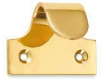
Pressed Sash Lift