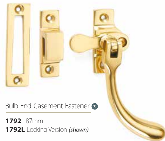
Bulb End Casement Fastener * 1792 87mm 1792L Locking Version (shown)