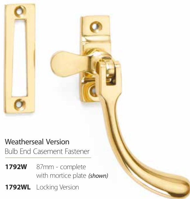
Weatherseal Version Bulb End Casement Fastener 1792W 87mm - complete with mortice plate (shown) 1792WL Locking Version