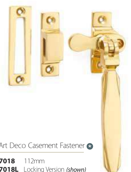
Art Deco Casement Fastener * 7018 112mm 7018L Locking Version (shown)

Part of the Art Deco Suite . See page 93 for further products.