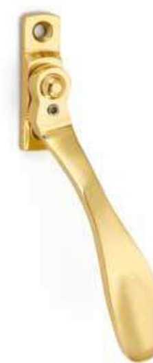
Spoon End - Narrow Style 6450 60 x 16mm Backplate 6450L Locking Version ( shown )