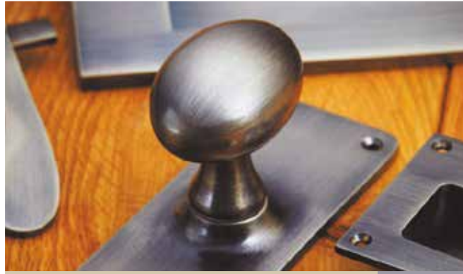
Antique Nickel * AN