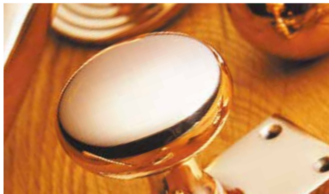
Polished Gunmetal PG