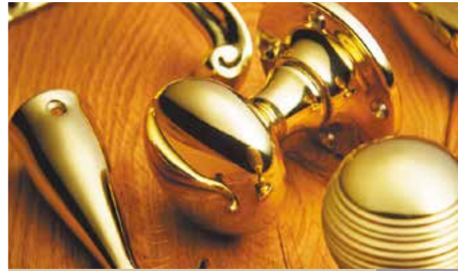
Polished Brass PB

Certain products cannot be manufactured in some finishes, please ask your AC Leigh representative for full details on those available for each product.