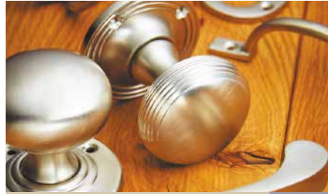
Satin Nickel Plate SNP