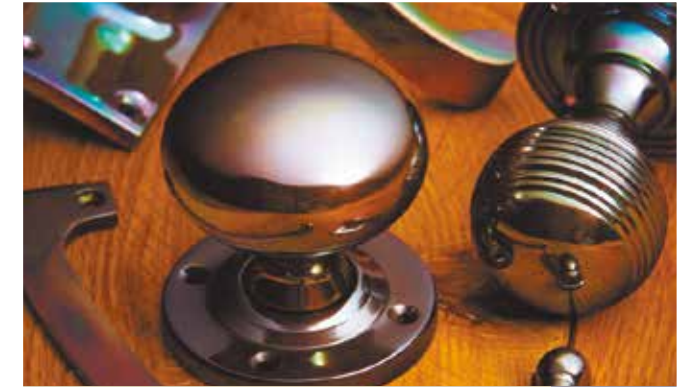
Real Bronze Metal Antique RBMA