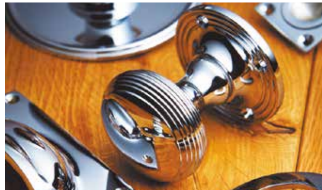
Chrome Plate CP