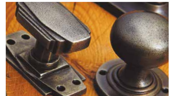
Distressed Antique Nickel * DAN