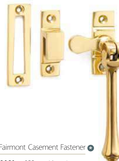
Fairmont Casement Fastener * 6461 100mm (shown) 6461L Locking Version