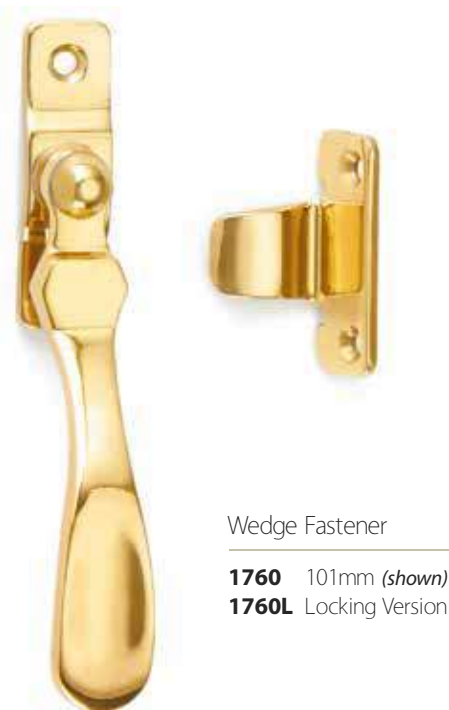
Wedge Fastener 1760 101mm (shown) 1760L Locking Version

These products are all suitable for windows fitted with a weatherseal.