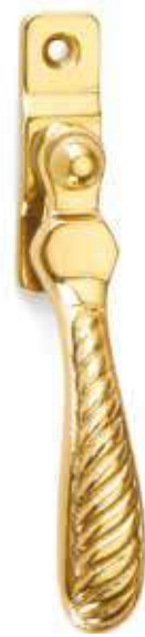
Cotswold Wedge Fastener 1738 101mm (shown) 1738L Locking Version