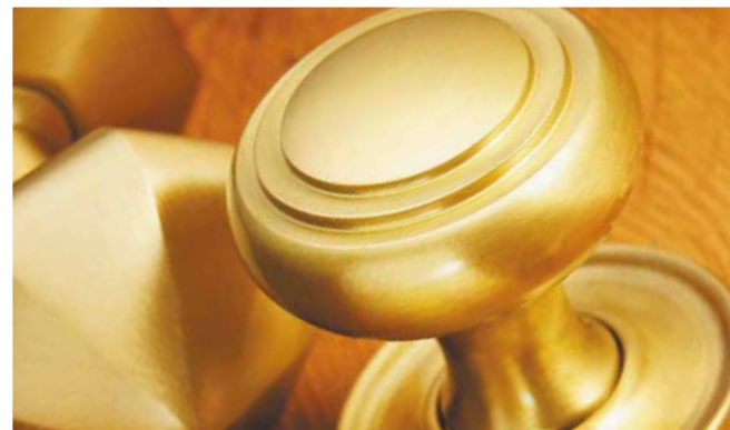
Satin Brass Unlacquered SBUL