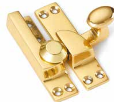
Straight Arm Sash Fastener