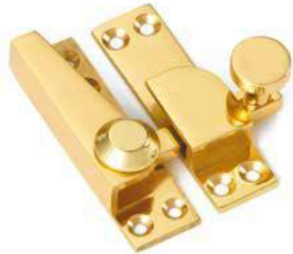
Straight Arm Sash Fastener