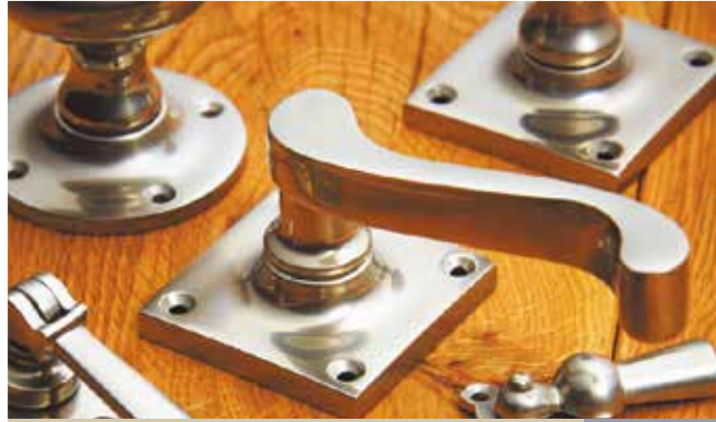
Pearl Nickel PRL