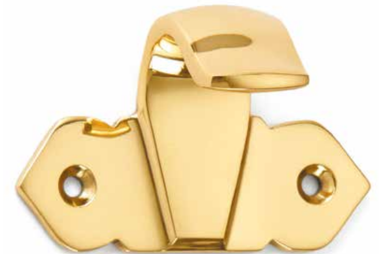
Ornate Sash Lift