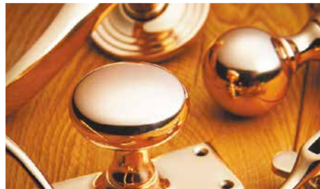
Polished Gunmetal Unlacquered PGUL