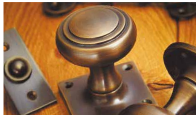
Antique Brass * AB