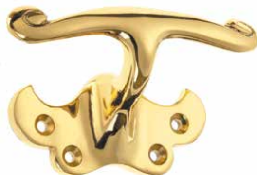
6424 Sash Handle – Single Stem 94mm