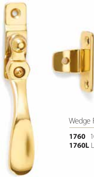
Wedge Fastener 1760 101mm 1760L Locking Version (shown)