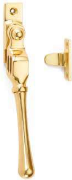
Bulb End Double Night Vent Fastener

1795 55 x 17mm Backplate ( shown ) 1795L Locking Version