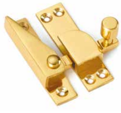
Straight Arm Sash Fastener - Narrow

2825N 67mm (shown) 2825NL Locking Version suitable for narrow sashes, 15mm wide body