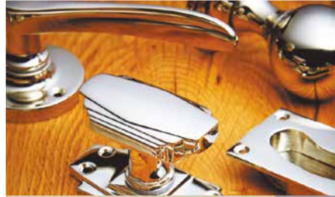
Polished Nickel PN