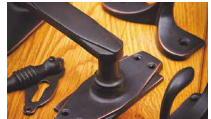
Distressed Oil Rubbed Bronze * DORB