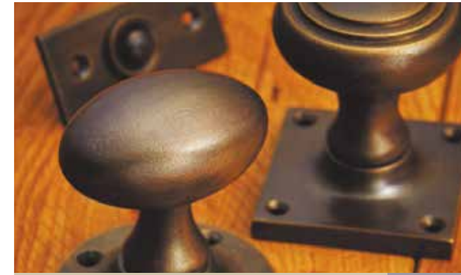
Distressed Antique Brass * DAB