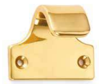
Cast Sash Lift