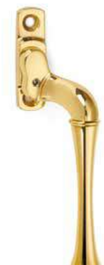
Fairmont - Narrow Style 6463 60 x 16mm Backplate 6463L Locking Version ( shown )