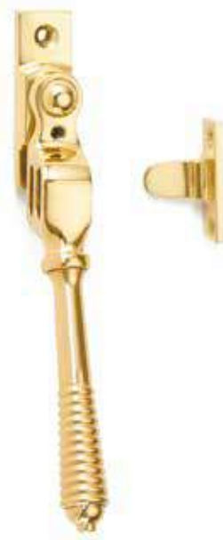
Reeded Double Night Vent Fastener

1797 55 x 17mm Backplate 1797L Locking Version ( shown )