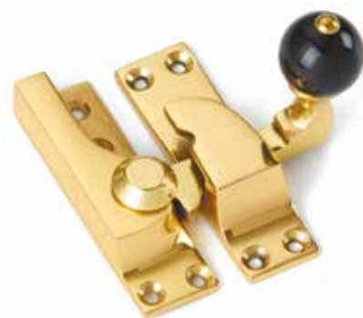
Large Straight Arm Sash Fastener