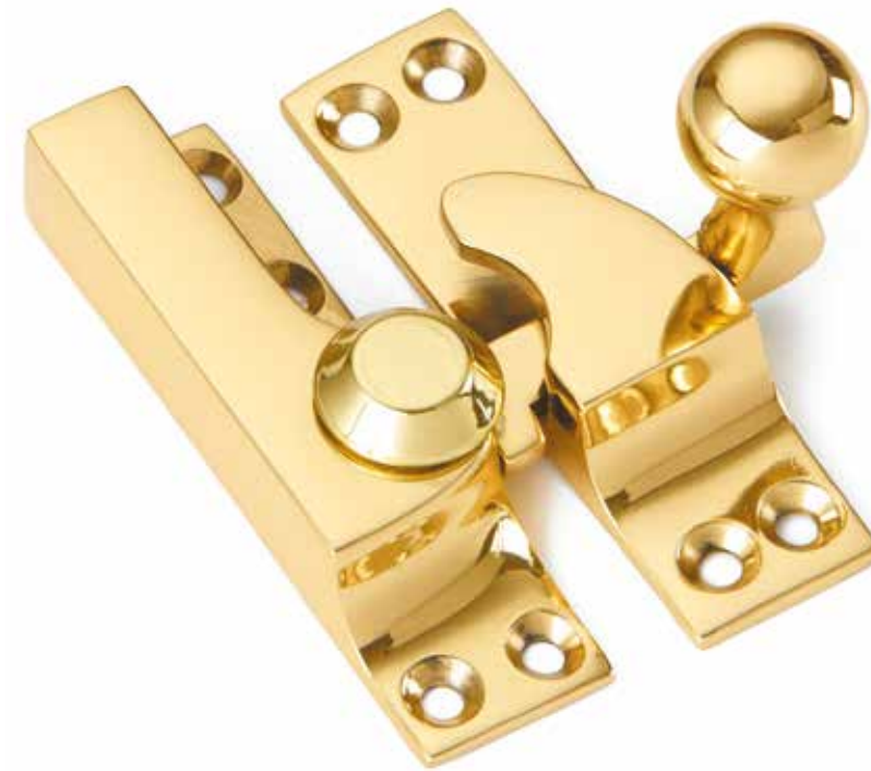
Straight Arm Sash Fastener