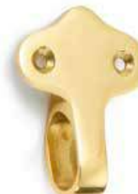
Flat Sash Lift