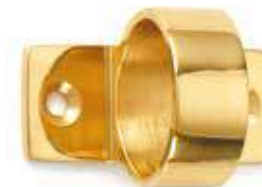
Ring Sash Lift