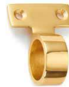
Ring Sash Lift