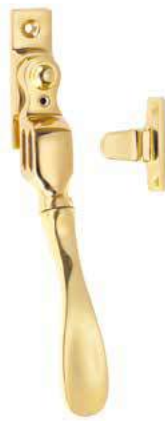
Spoon End Double Night Vent Fastener

1795 55 x 17mm Backplate ( shown ) 1795L Locking Version