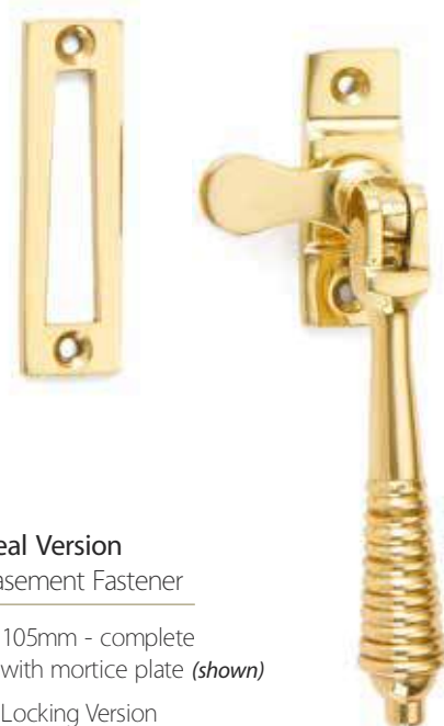
Weatherseal Version Reeded Casement Fastener 6436W 105mm - complete with mortice plate (shown) 6436WL Locking Version