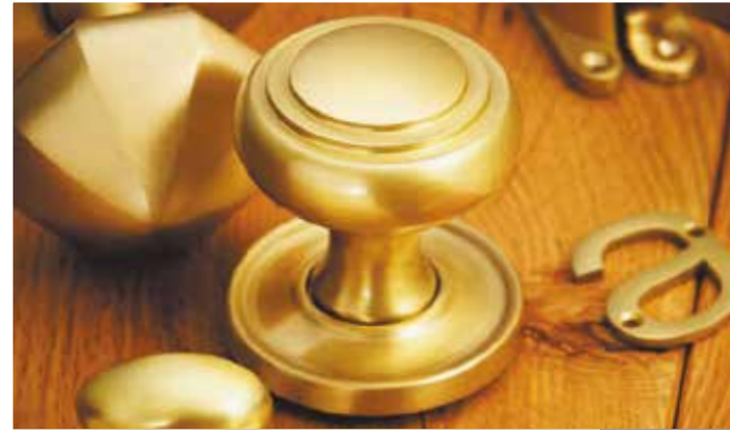
Satin Brass SB