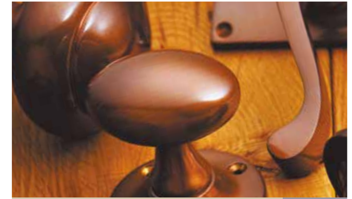
Imitation Bronze Metal Antique * IBMA