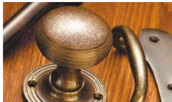
Marbled Brass * MB