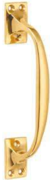
1653 Pull Handle Available in 203mm (8"), 254mm (10"), or 305mm (12")