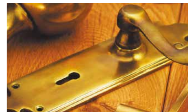
Aged Brass *