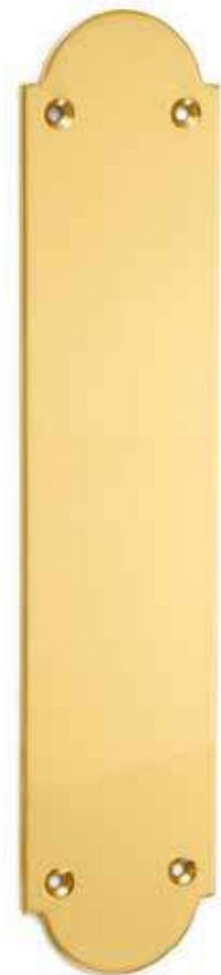
1758R Shaped Finger Plate, 3mm 305 x 64mm (12" x 2½") 368 x 76mm (14 ½" x 3") Other sizes made to order.