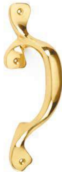
4129 Pull Handle 250mm this item is handed