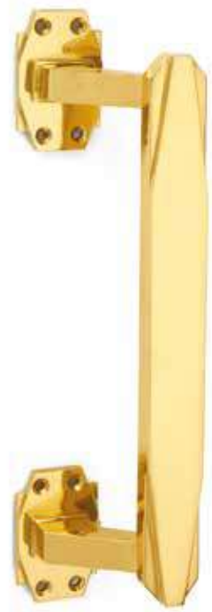
7009 Art Deco Pull Handle on Roses Available in 265mm or 300mm