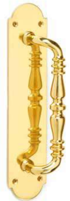
1954R Ornate Pull Handle on Shaped Plate 305 x 63mm Backplate or 368 x 76mm Backplate