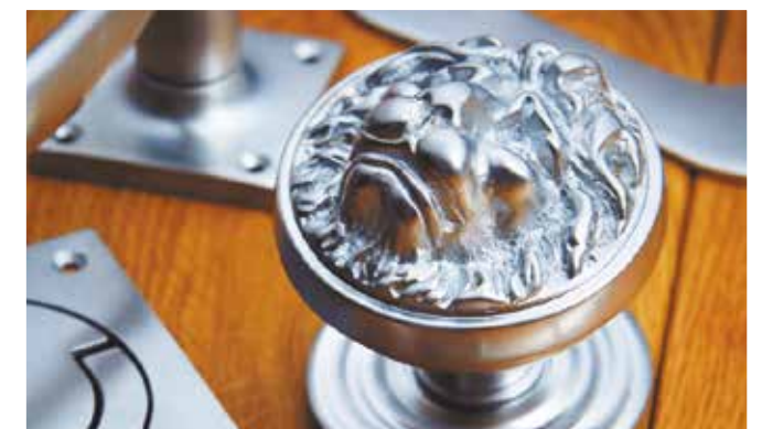
Satin Chrome Plate SCP