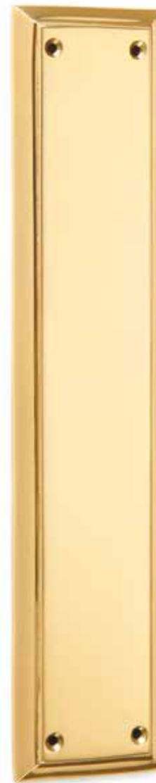
1954FP Cast Finger Plate 305 x 64mm 368 x 76mm