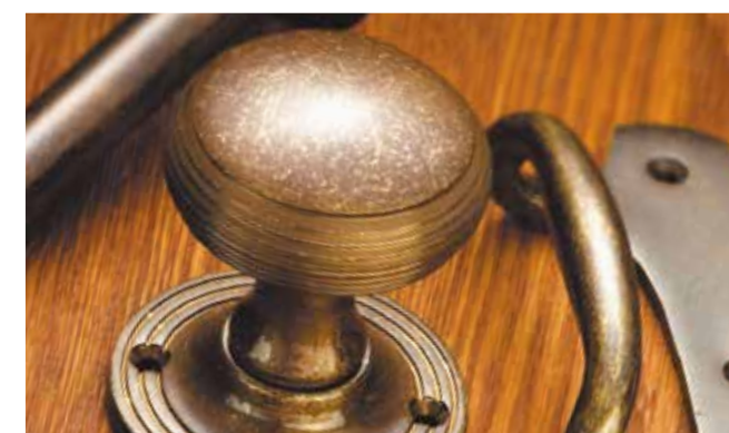
Marbled Brass *