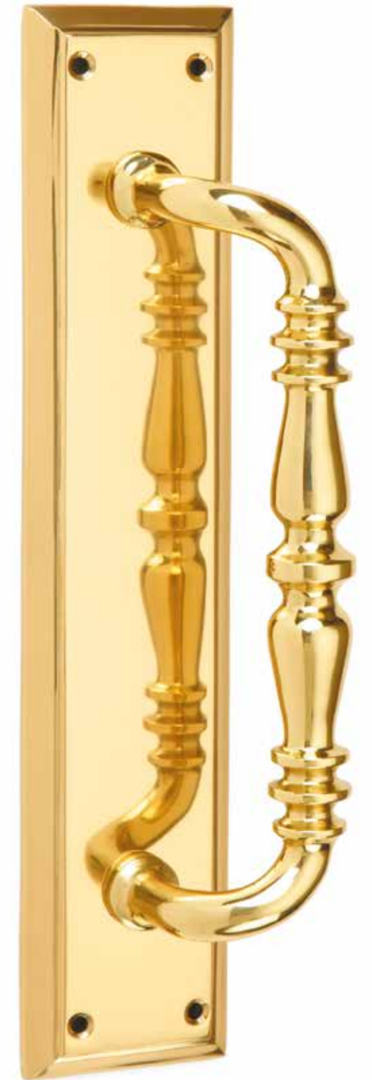
1954 Ornate Pull Handle on Plate 305 x 63mm or 368 x 76mm