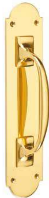
1651R Pull Handle on Shaped Plate 203mm handle on 305 x 64mm plate or 254mm handle on 355 x 76mm plate