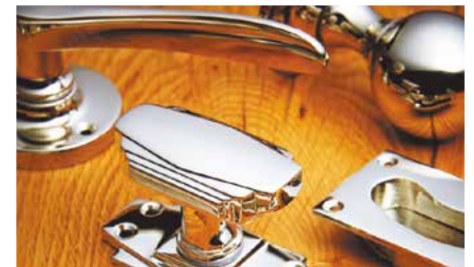
Polished Nickel PN