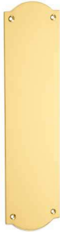
1758A Ribbon Edge Finger Plate, 1.5mm 305 x 76mm (12" x 3")