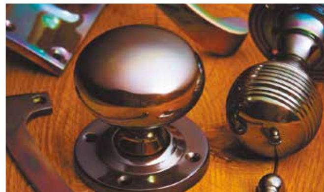
Real Bronze Metal Antique RBMA