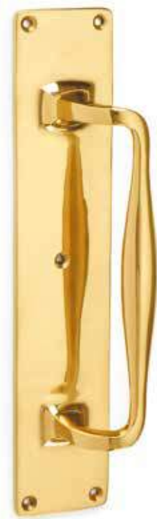
1654 Cast in One Pull Handle on Plate 305mm (12") or 355mm (14")