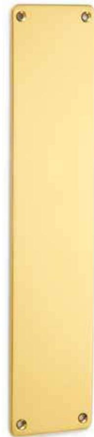
1758RC Finger Plate with Rounded Corners, 3mm 305 x 64mm (12" x 2½") 305 x 76mm (12" x 3") 355 x 64mm (14 ½" x 2½") 375 x 76mm (14 ¾" x 3") Other sizes made to order.