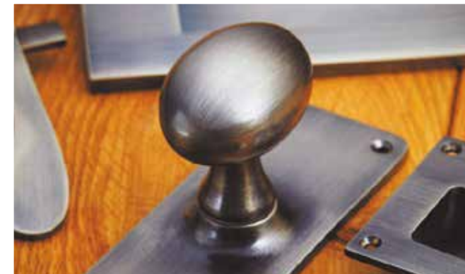
Antique Nickel * AN