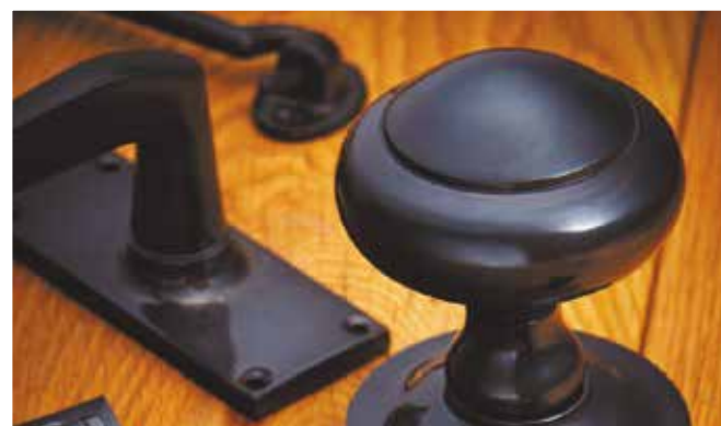
Dark Bronze Metal Antique * DBMA