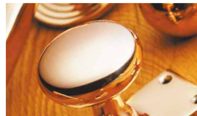
Polished Gunmetal PG