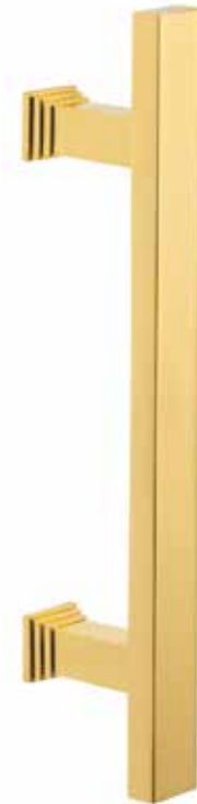
6384 Plain Bar Pull Handle Available in 152mm (6"), 229mm (9") or 305mm (12")