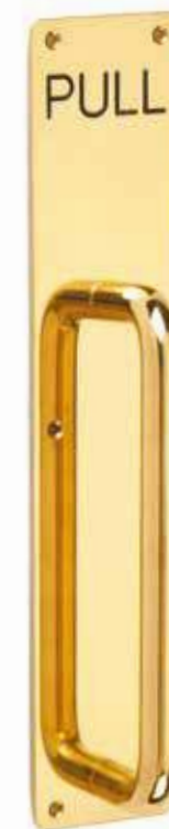
1692 Engraved Pull Handle on Plate 375 x 75mm