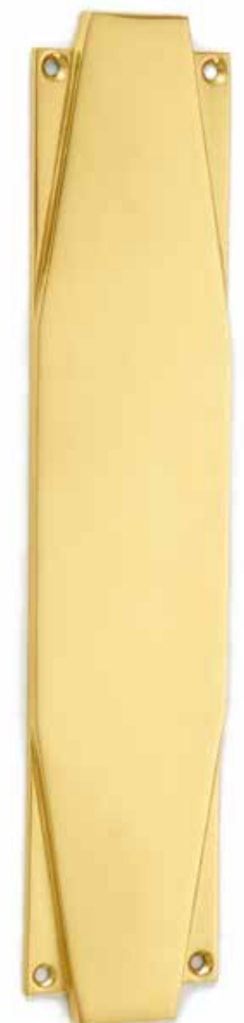
7011 Art Deco Finger Plate 305 x 65mm 375 x 76mm