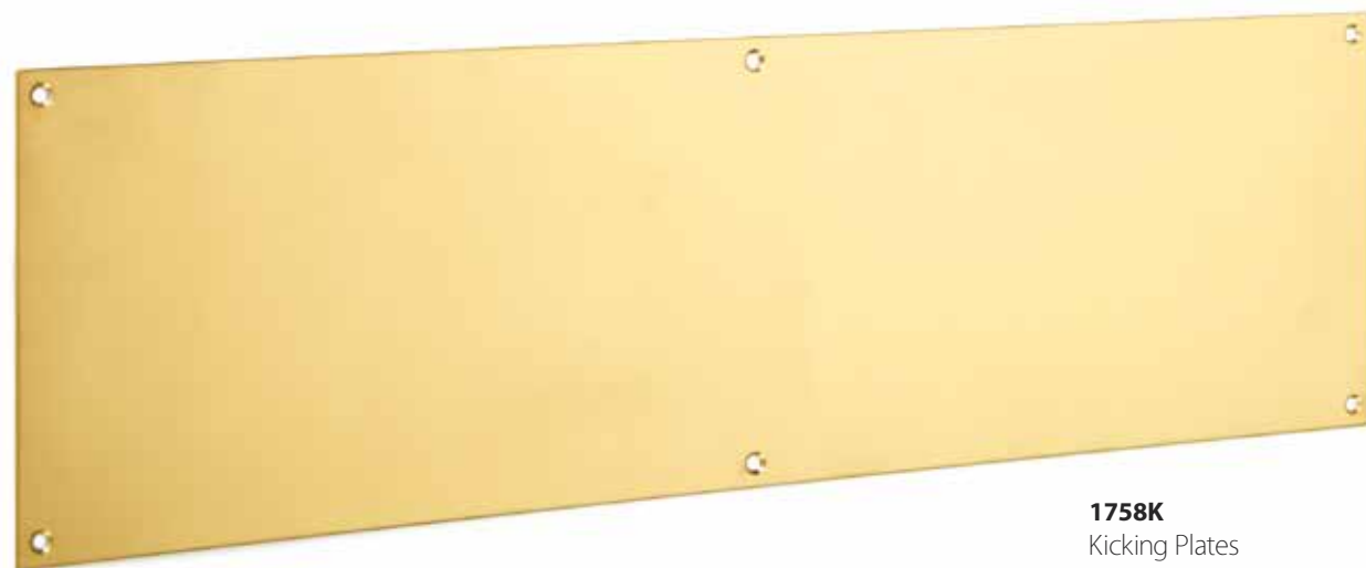
1758K Kicking Plates All sizes made to order.