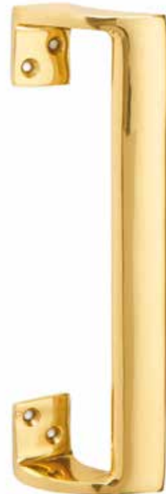
1652 Pull Handle Available in 229mm (9") or 305mm (12")