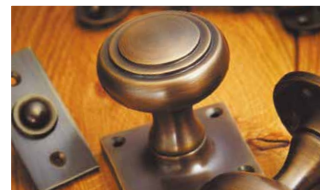
Antique Brass *