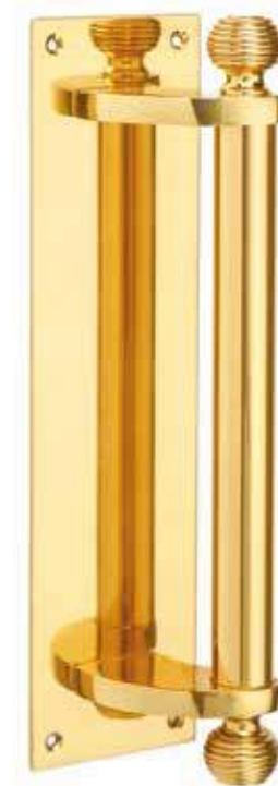
6386 Pull Handle on Plate, Reeded Finials 305 x 76mm Backplate