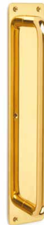
1691 Pull Handle on Plate 229 x 19mm or 305 x 19mm