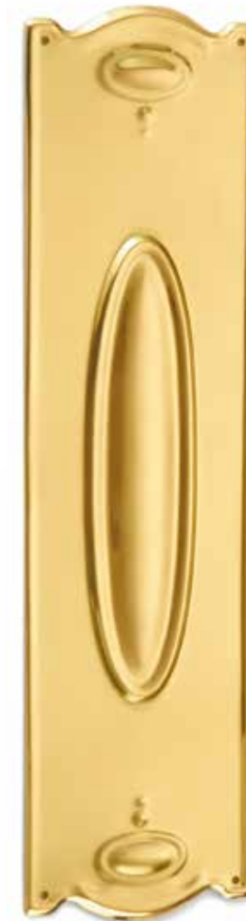
6357 Pressed Finger Plate 279 x 76mm