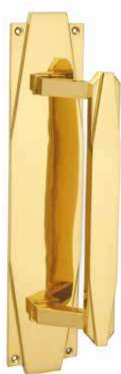
7010 Art Deco Pull Handle on Backplate 305mm x 65mm or 375mm x 76mm