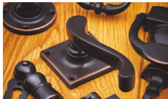
Oil Rubbed Bronze * ORB