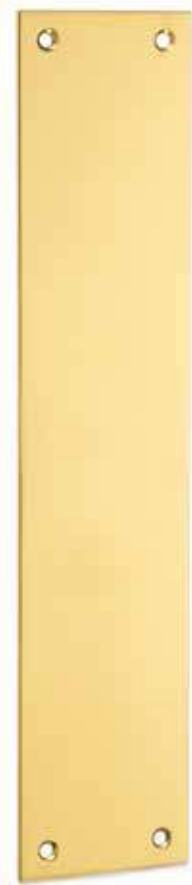
1758 Plain Finger Plate, 1.5mm 305 x 64mm (12" x 2½") 305 x 76mm (12" x 3") Other sizes made to order.