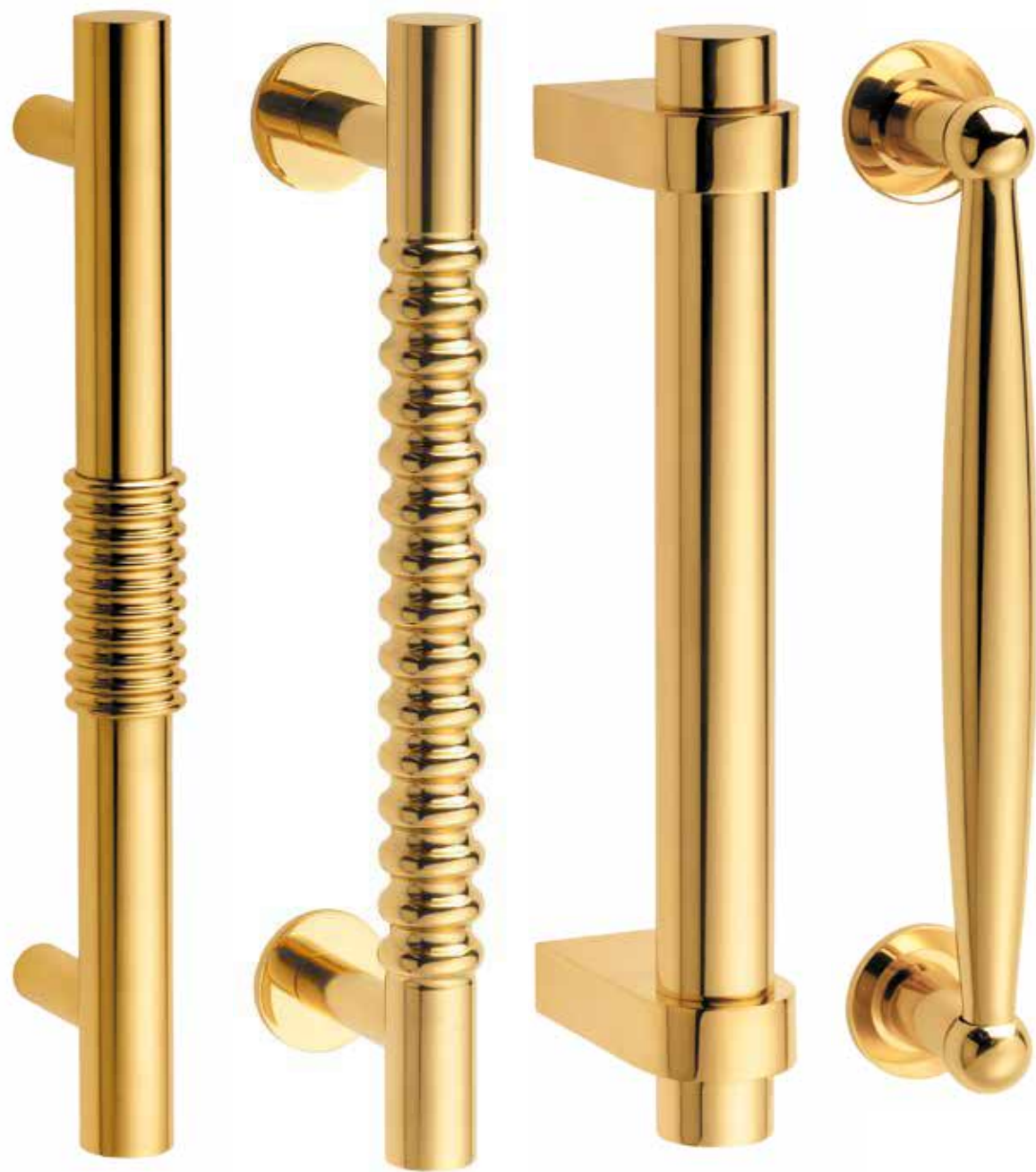
6387 Reeded Pull Handle Available in 152mm (6") 229mm (9") 305mm (12")