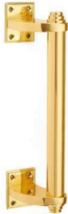
6385 Pull Handle on Roses 290mm