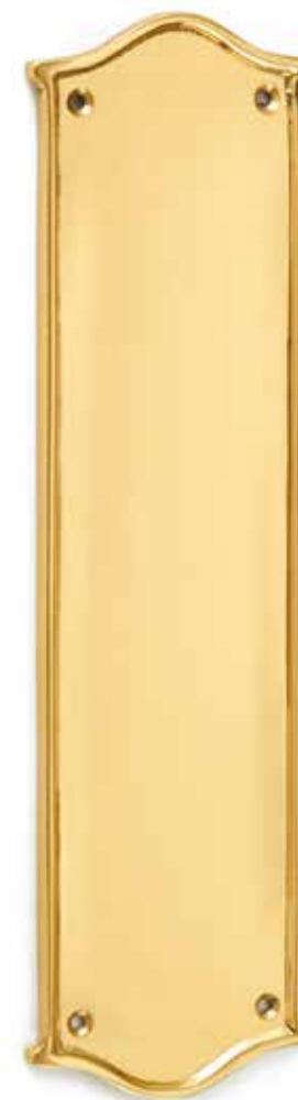
4130FP Cast Finger Plate 288 x 80mm