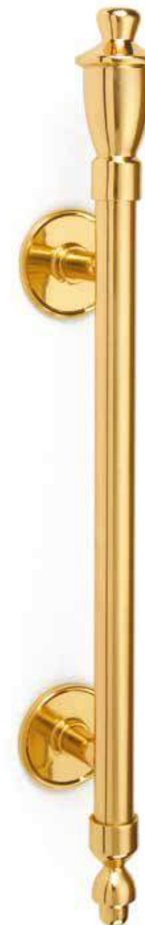
6390 Pull Handle on Roses Available in 558 or 762mm