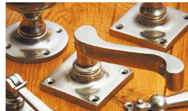
Pearl Nickel PRL