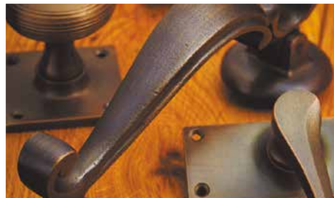
Tudor Bronze TB