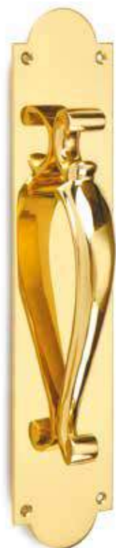
4125 Doctor's Pull Handle on Plate 368 x 76mm Backplate