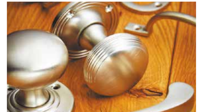
Satin Nickel Plate SNP