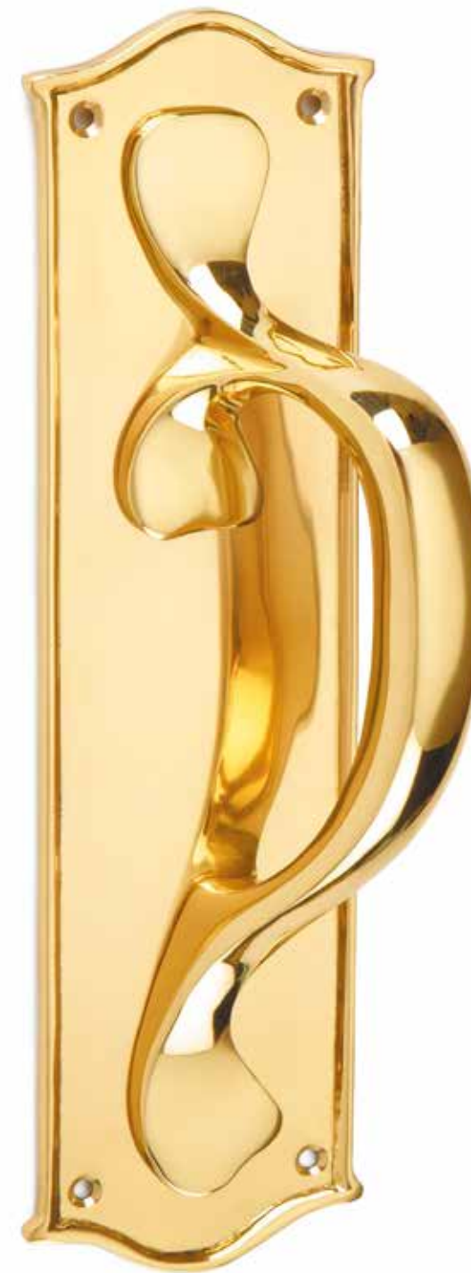
4130 Pull Handle on Plate 298 x 82mm this item is handed