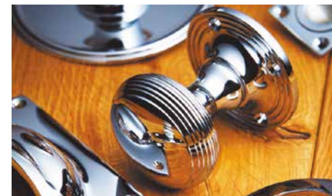
Chrome Plate CP