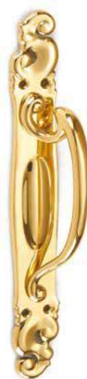
3100 Decorative Pull Handle on Plate 350mm (13 3/4") this item is handed