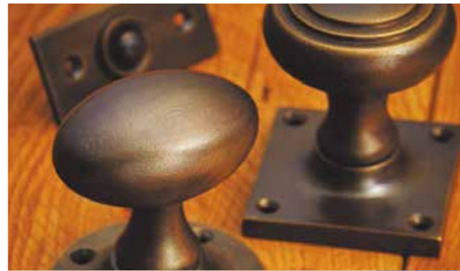
Distressed Antique Brass * DAB