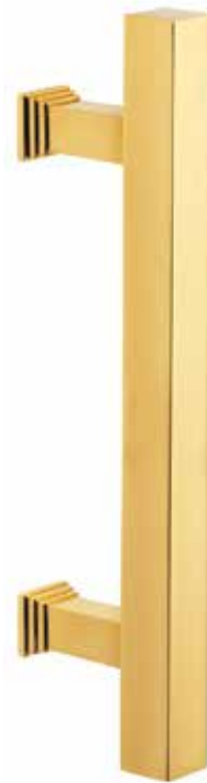
6384SQ Square Bar Pull Handle Available in 152mm, 229mm or 305mm