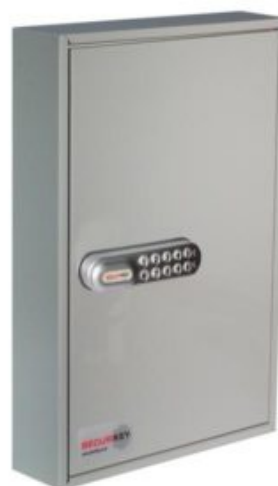
System 64 CL1000 Electronic Cam Lock