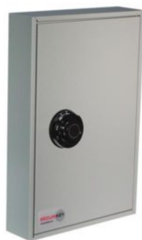
System 64 Dial Combination Lock