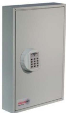
System 64 Electronic Lock REVO A