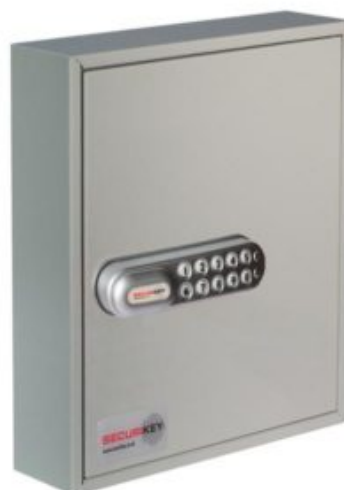
System 48 CL1000 Electronic Cam Lock