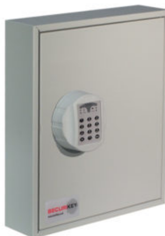
System 48 Electronic Lock REVO A