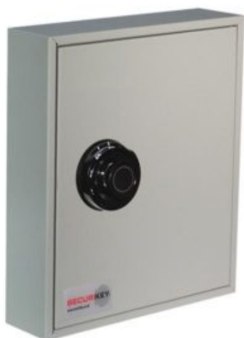
System 48 Dial Combination Lock