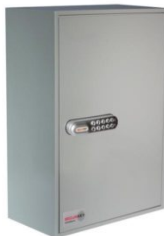
System 300 CL1000 Electronic Cam Lock