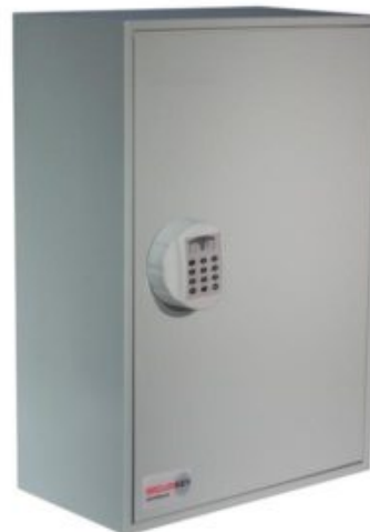
System 300 Electronic Lock REVO A