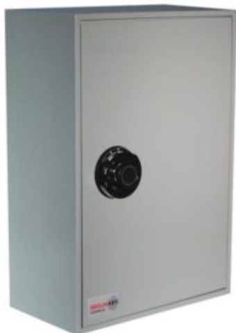
System 300 Dial Combination Lock