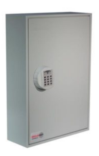
System 20 Electronic Lock REVO A