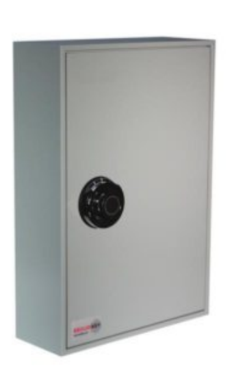
System 200 Dial Combination Lock