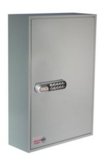
System 200 CL1000 Electronic Cam Lock