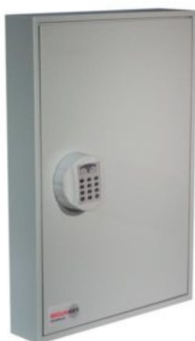
System 20 Electronic Lock REVO A