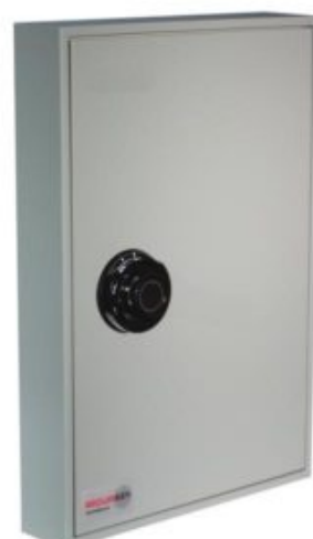
System 100 Dial Combination Lock