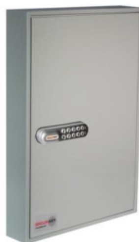
System 100 CL1000 Electronic Cam Lock